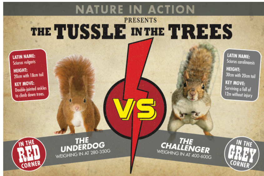
Figure 1: Squirrels do not like each other.

Grey, G , and red, R , squirrel populations undergo the following interactions: